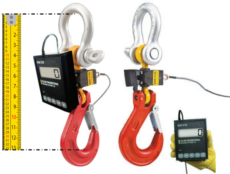
Capacities 0.5t - 15t

Environmental: Weather proof NEMA4, IP65.